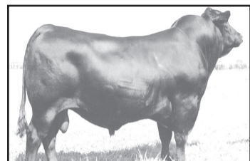
MUSCLE Muscle is a big, deep, wide soggy bull that is very easy keeping. His calves are very small at birth.