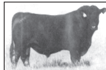
S A V 004 Hold'em 4452 Hold'em was one of the top selling in the 2005 Schaff Sale. He sires thick, easy doing cattle.

LUDELL, KANSAS LOCATION: 13 Miles Northeast of Atwood, Kansas