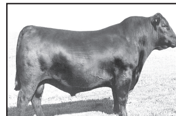
FREY'S 486R Frey's 486R is a bull that covers all the bases. His calves are small at birth that grow quickly.