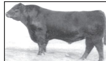
FREYS PROUD DESIGN 410P 410 is a very easy calving bull, with tons of performance. His calves ratioed very high.

2.1 55 22 98 AVERAGE EPD'S ON NEMETH BULLS Sale Bulls are in Top 3% of Breed for both Weaning and Yearling Weights.