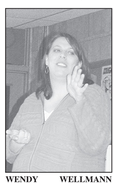
speaking to parents at Cheylin school.

Statistically, the organization participants have been shown to be a potent weapon in the battle against rested, skip school, be engaged in states.