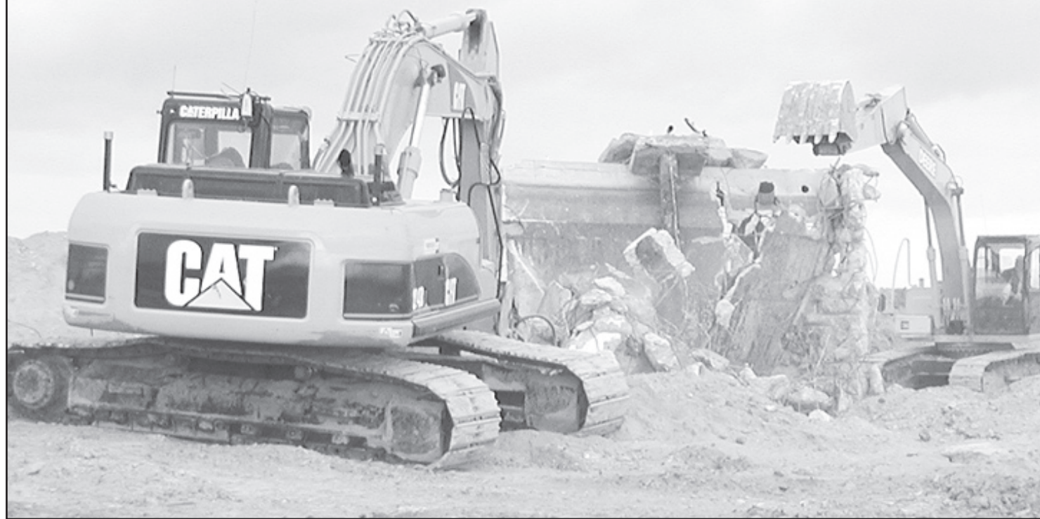
BSB CONSTRUCTION IS CLOSE TO completing the wastewater lagoon project. Above the crew demolished the old wastewater treatment building which has been standing for over 50 years.