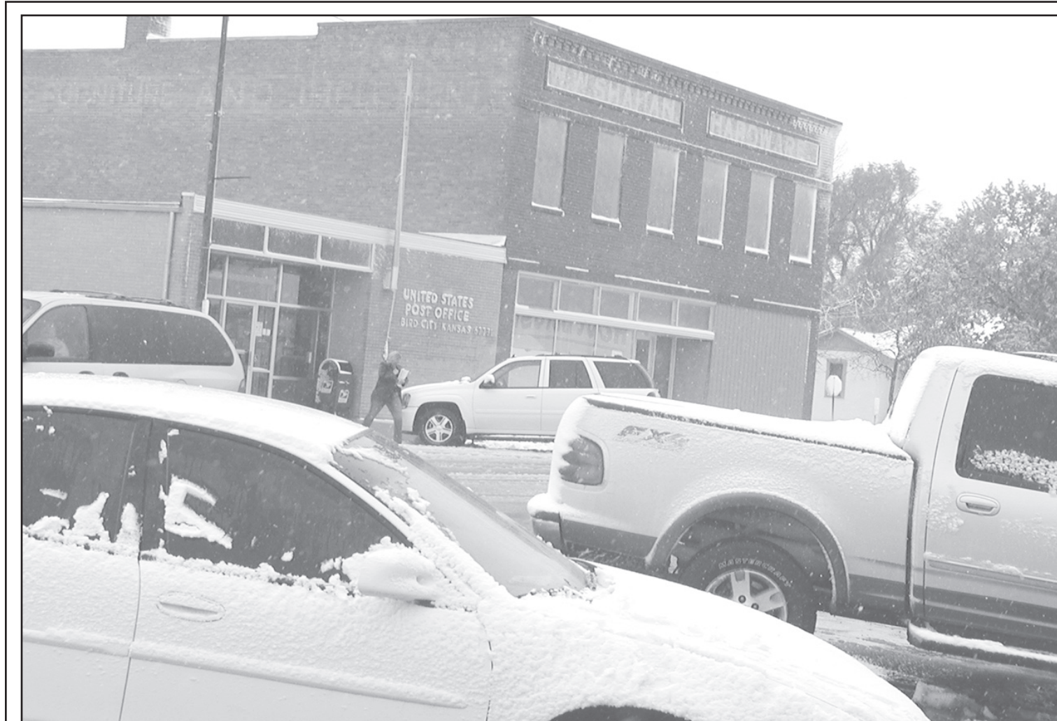
SNOW COMES EARLY! This isn't the first time folks have gotten their first taste of winter snow in October. Luckily accumulations were small, but some drifts did fill the ditches.