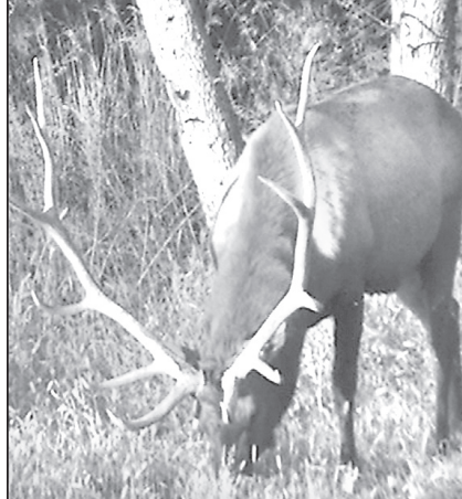
— No license required — Several Bulls to choose from