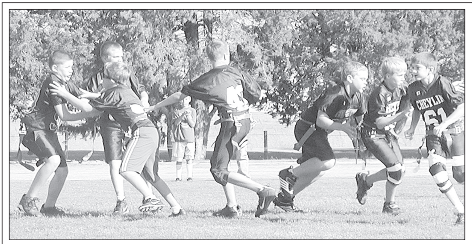
FLAG FOOTBALL - The Cheylin team plays their first outing of the season against the Grinnell/Wheatland team on Thursday afternoon.