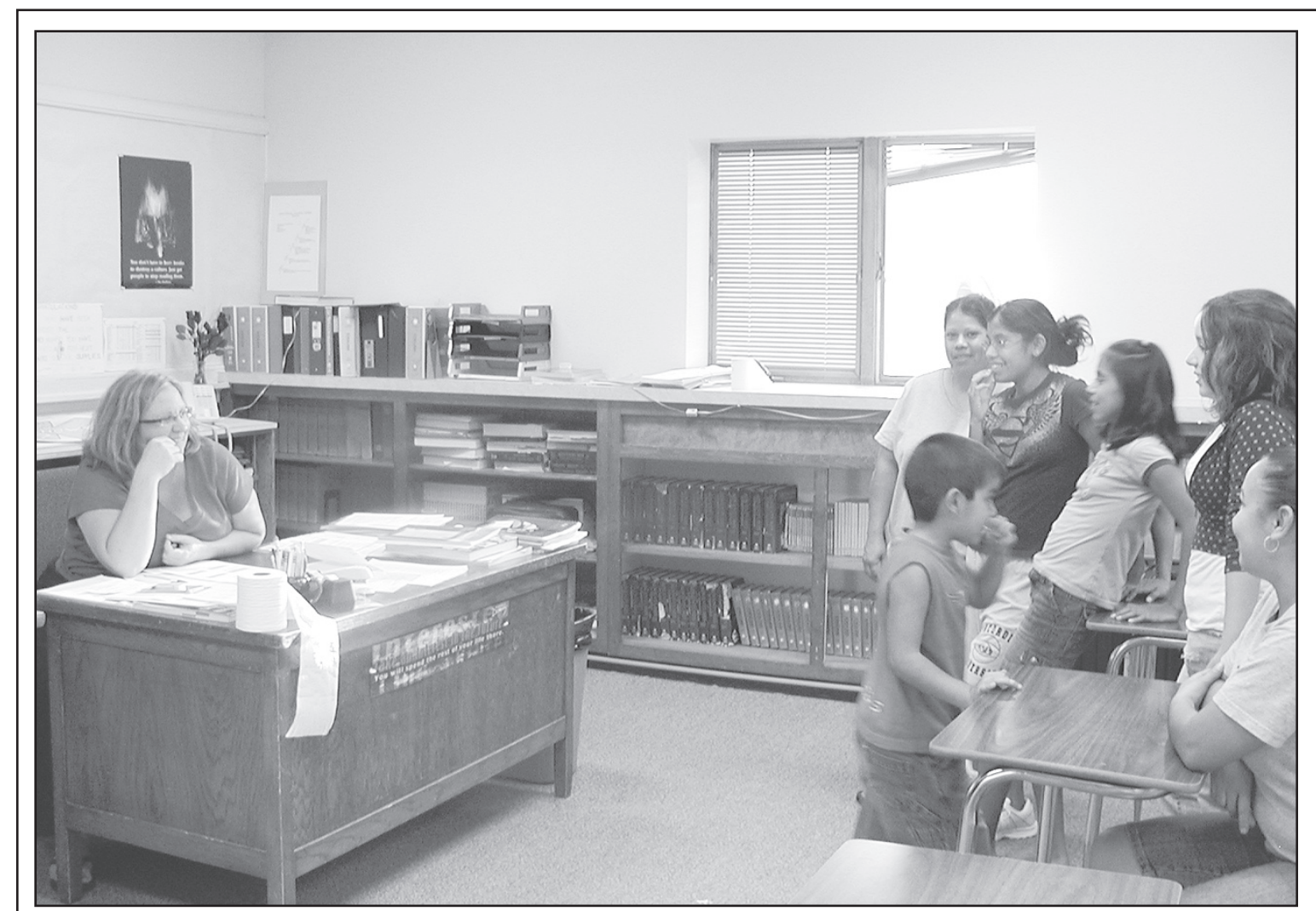
IT WAS OPEN HOUSE AT CHEYLIN on Monday night. Parents where able to visit their children's room and talk with teachers. Attendance was good and an ice cream social followed.