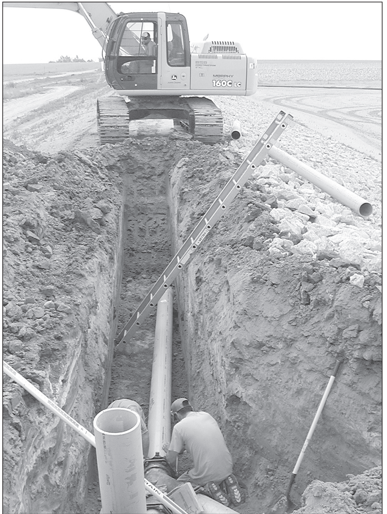
BSB CONSTRUCTION CREW is laying the transfer pipes from one waste lagoon to the other. The crew has also laid down the rip-rap around the lagoons.