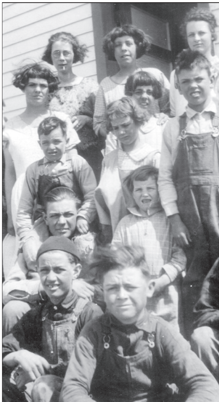
THE 2008 THRESHER QUEEN was in first grade posing with her fellow classmates at the country school she attended. There could be anywhere from three to 15 pupils at a time. Attending church with her neighbor, and friends is a special memory.

The Foundation is a community foundation, which represents an opportunity for all friends of the Bird City community to give, through philanthropy, back to the Bird City community to enhance and ensure the quality of life for present and future generations of Bird City.