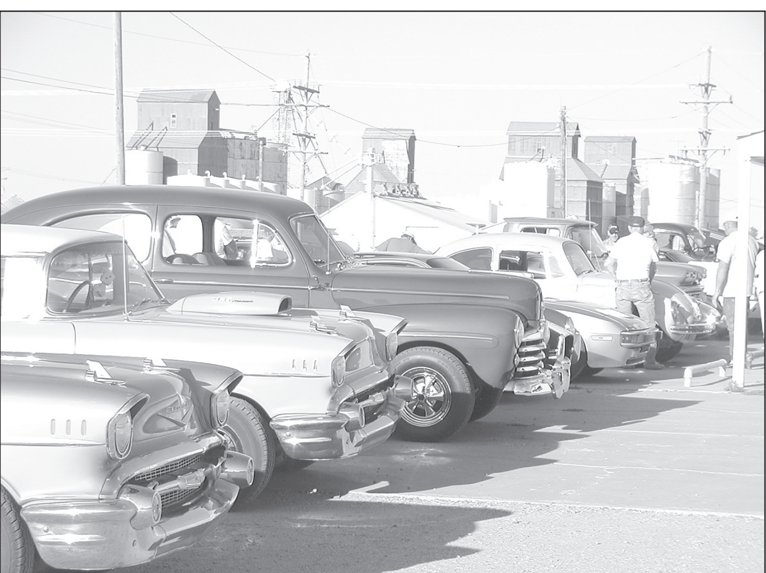
'CRUISE NIGHT' in Bird City Diner parking lot, had over 20 new and antique cars line up on Saturday night.