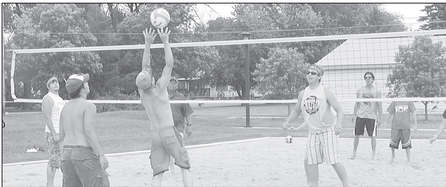
THE COMMUNITY VOLLEYBALL tournament took place on Sunday. Each team had a half an hour to play. It was fun and laughter for the players as they dove, jumped and spiked the ball.