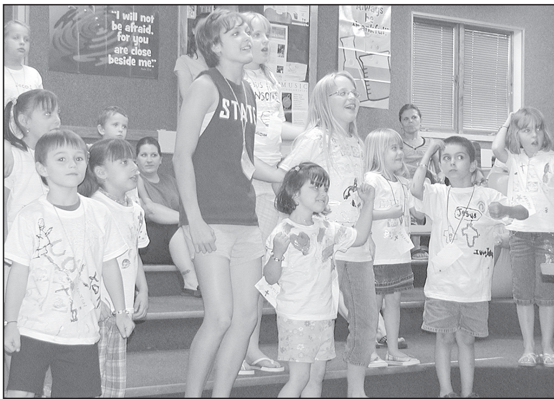
LAST NIGHT of Vacation Bible School and the kids are showing their friends and family the "Power of Jesus." After the program everyone was treated to ice cream.