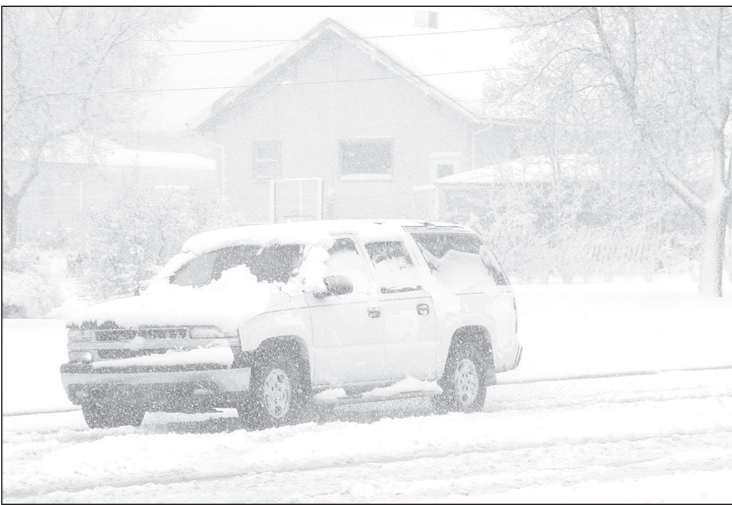
AN APRIL SNOWSTORM provided nice moisture for the area on Thursday. School was closed for the day and several other activities were postponed.

Northwest Kansas Family Shelter provides 24-hour-7 day-a-week services to victims of domestic violence and sexual assault. Weekly support groups are available for women and children within the northwest Kansas area. For information or if you are in need of assistance, please call the toll-free number 1-800-794-4624.