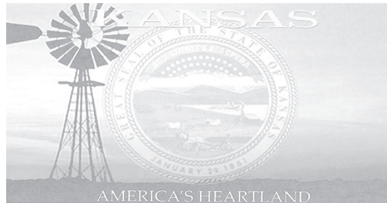
License Plate #4