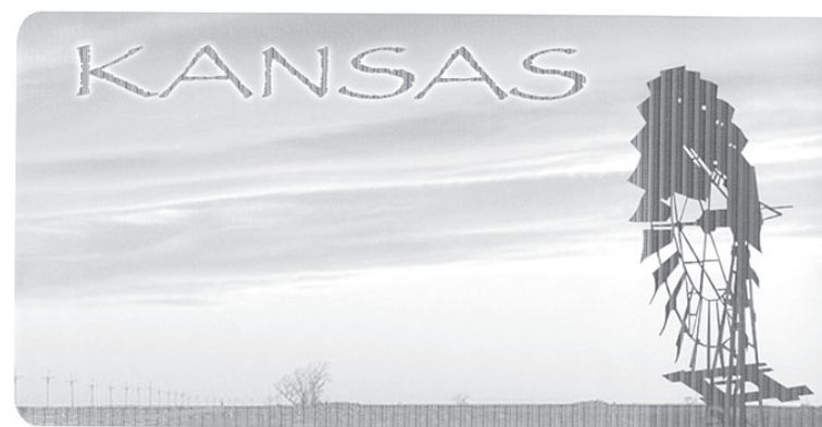
License Plate #5