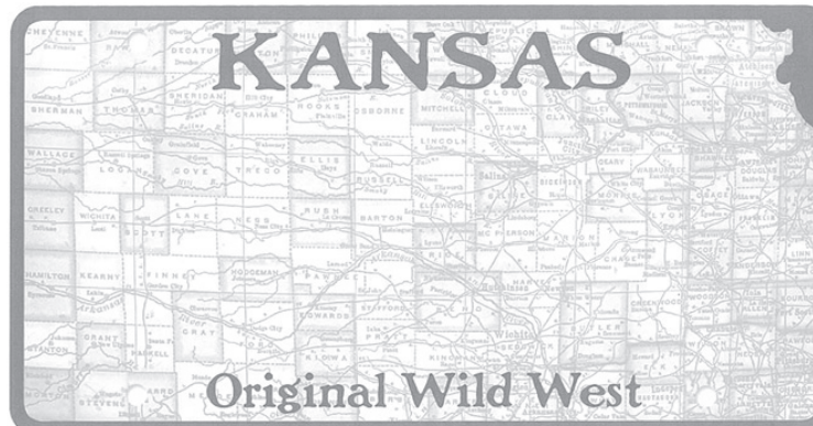
License Plate #3