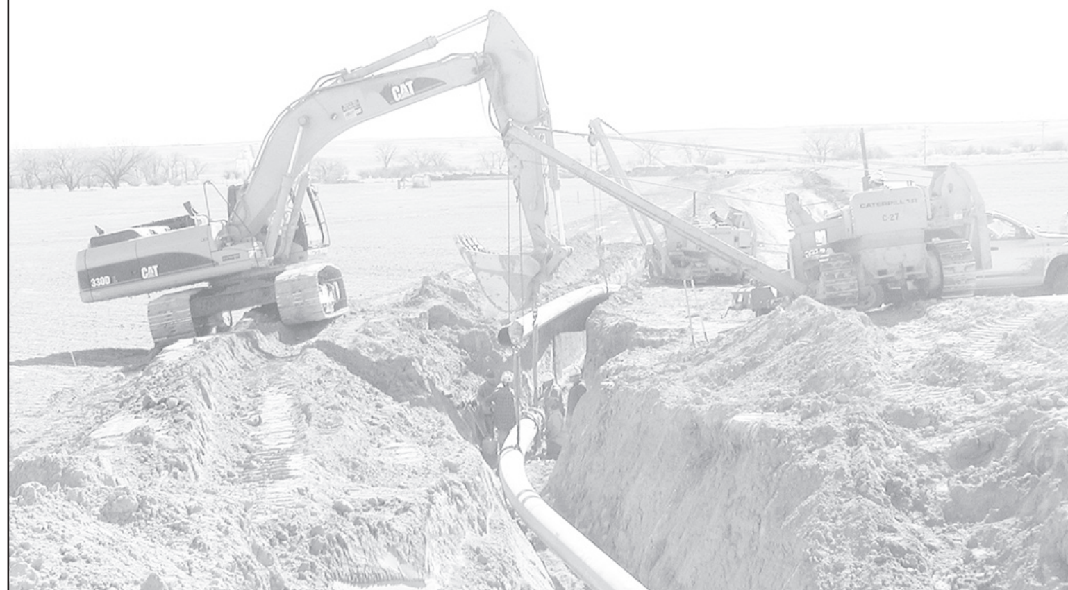
LOWERING A 20-FOOT SECTION of steel pipe to carry natural gas — the pipe is being laid across Cheyenne County. This line is being put in out north of U.S. 36.