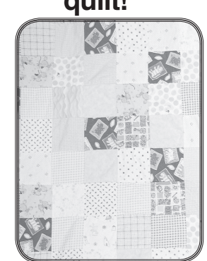
Prairie Piecemaker Quilt Guild Goodland

The first baby of the year received this special quilt!