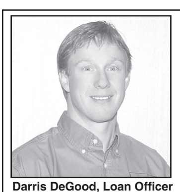
Farm Credit of Western Kansas

Now they are ready to take customers traveling, whether it be abroad or in the United States or on