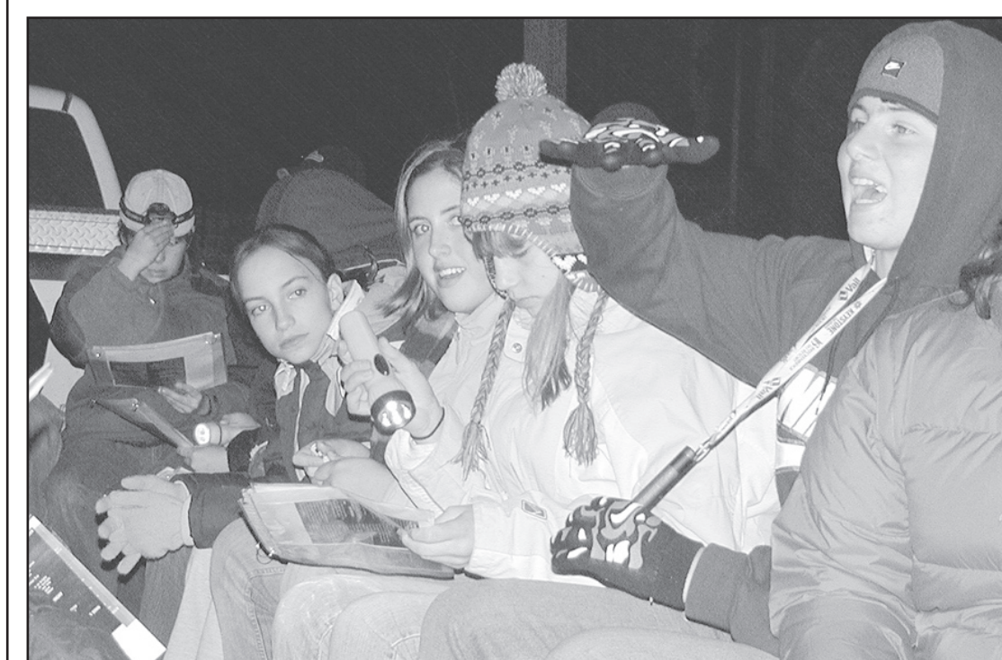
WE WISH YOU A MERRY Christmas! The streets of Bird City were alive with the caroling by the Teens for Christ during the holidays.