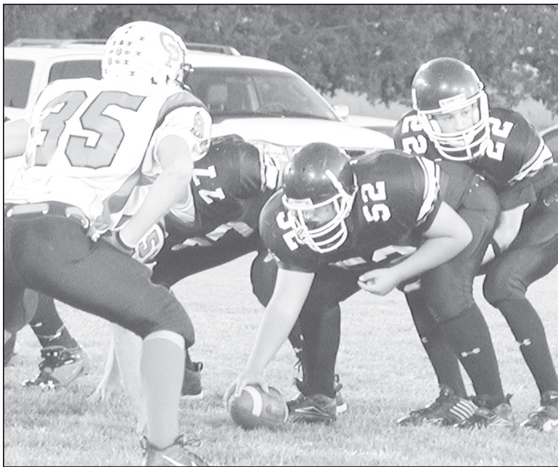
THE COUGARS prepare for an offensive attack against Golden Plains in their final game of the year.