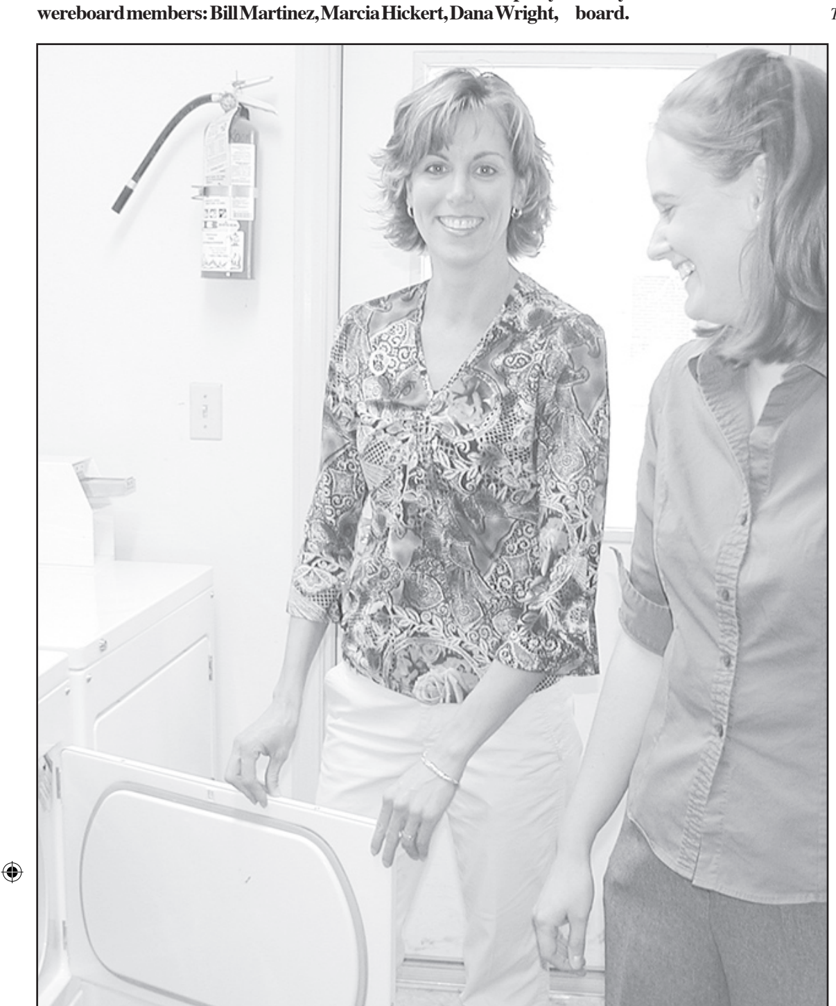
BIRD CITYCentury II Development Foundation donated two