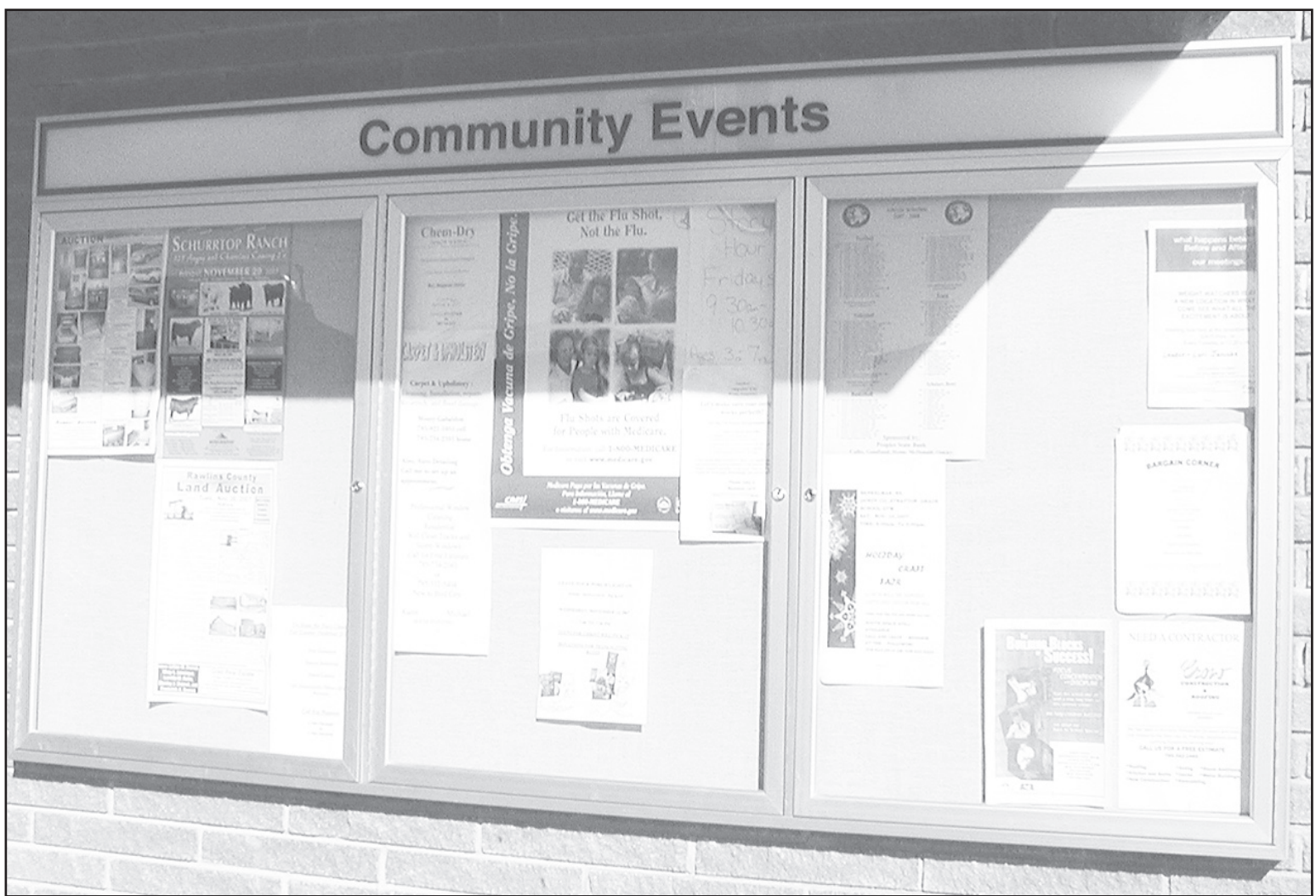
CENTURY II is making it possible for community members and visitors to view events planned by dropping by the Community Bulletin Board downtown.

Again, some folks today would deny the brutality of the Japanese and the Nazi extermination of Jews and other civilians during World War II. America's hand was forced into the war after the sneak attack on Pearl Harbor by the Imperial Navy on a Sunday morning in 1941. As the war progressed the U.S. forces struggled back after early defeats. The Navy turned the tide with victories at places like Midway and the Coral Sea. Ground attacks were led primarily by Marines who began pushing the Japanese back across the Pacific Ocean one island at a time. Battles on Guadalcanal, Tarawa, Guam, Iwo Jima and Okinawa were testaments of Marine bravery and determination. At each small atoll or chunk of volcanic rock, the Japanese fought to the bitter end. Most chose suicide over surrender. If the Enola Gay had not dropped the bomb, this kind of fighting certainly would have continued to the heart of the Japanese mainland. War is hell. Luckily Tibbets brought it to an earlier end. Veteran's Day is Nov. 11. Let a veteran know you appreciate your freedom which has been paid for by men like Tibbets and other vets.