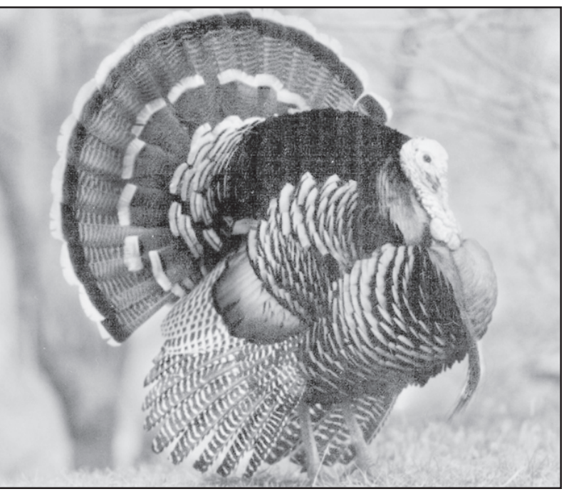
THIS tom turkey fanned his tail feathers in full strut.