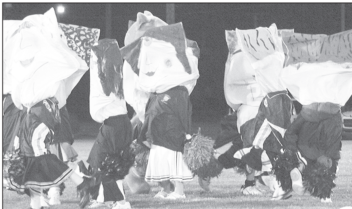
THE 'PILLOW PEOPLE' did a great job on their routine.

Helping with the festivities was the Booster Club members who provided a barbecue on Friday and First National Bank and Peoples State Bank employees who served a barbecue on Thursday.