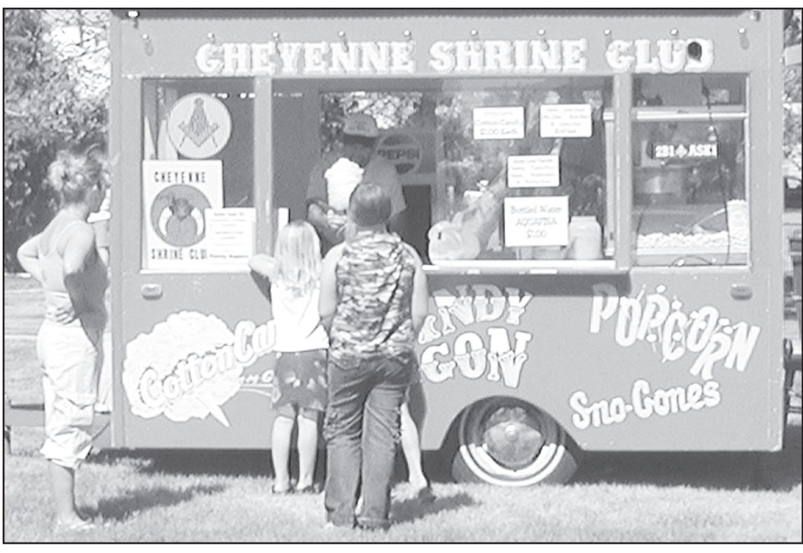
CHEYENNE COUNTY SHRINE CLUB has been busy throughout the community by raising money for different organizations along with providing balloons during the Cheyenne County parade.

Among the things members helped with include: