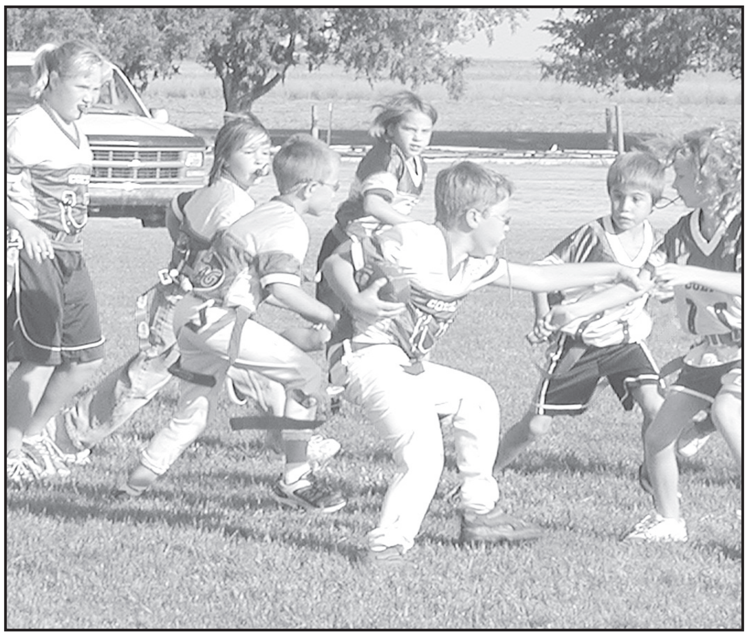
WITH THE START OF SCHOOL comes the fun of flag football. Saturdays. This year there have been three teams competing. Except for some winds, the weather has been warm for playing on.