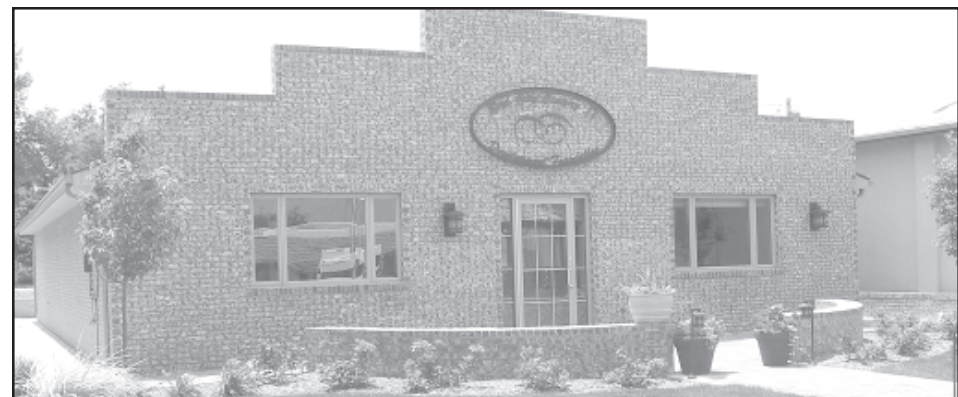
Bird City Century II Office