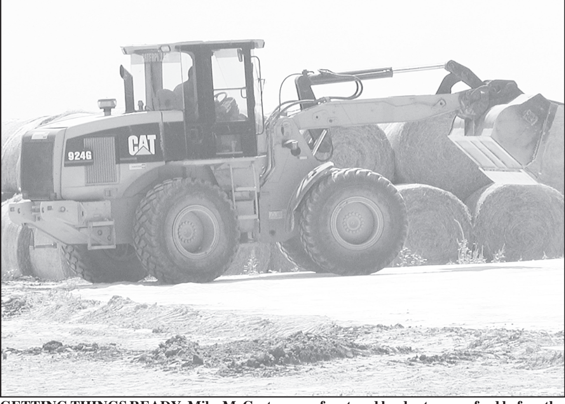
GETTING THINGS READY. Mike McCarty uses a front-end loader to move feed before the