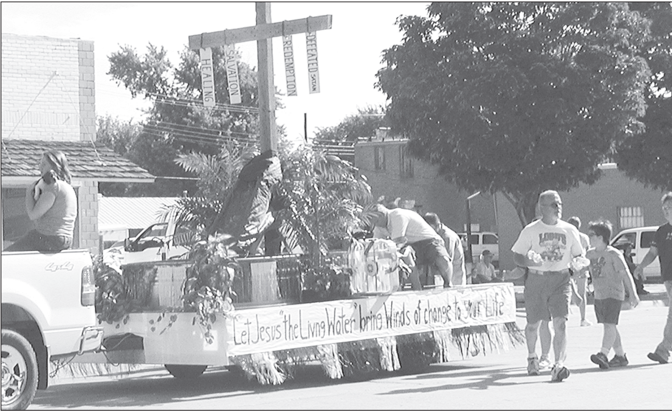
Living Waters Church - First place - Organization Division