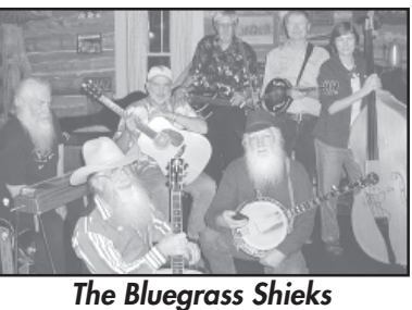
of Colorado Front Range

Bluegrass Music Home-Cooked Food and Great Nebraska Fun!