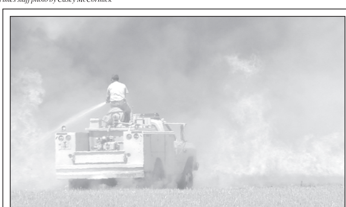
FIREMEN fight fire 5 miles south of U.S. 36 on road 31, west of the Dan Busse farm most of the day on Monday.