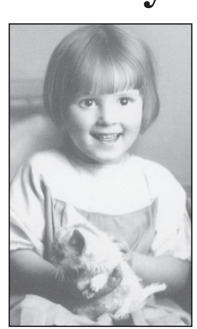
2007 Thresher Queen

"Guess this is all for now. So guess who I am," the mystery queen