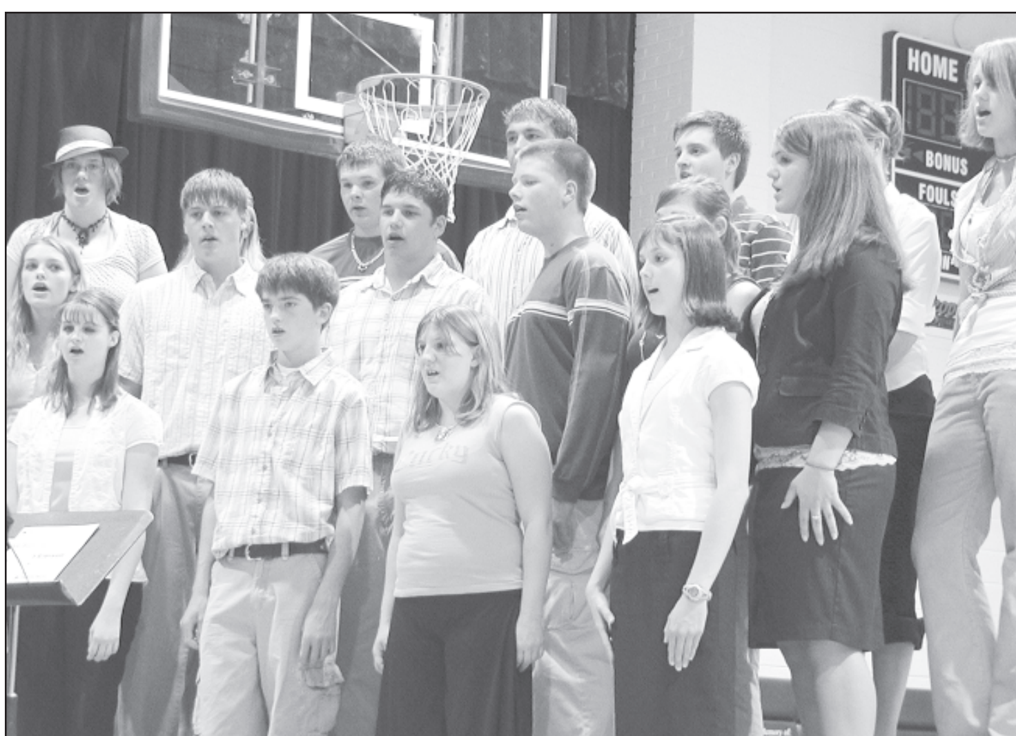
Members of the Cheylin High School Choir perform at the Super Band Concert held on Tuesday, May 15 in the McDonald Gym.