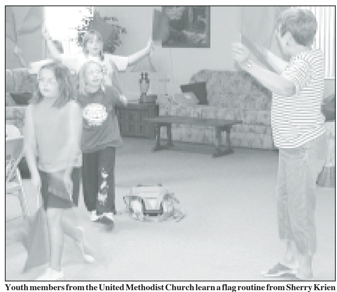
for a special service on Pentecostal Sunday.