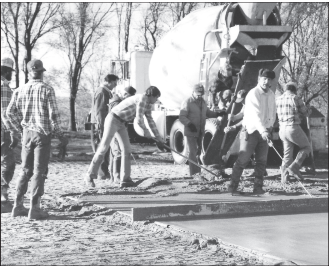
VOLUNTEERS gathered to run the cement for the museum in 1985. By 1986, the first quarterly meeting was held in the unfinished building.