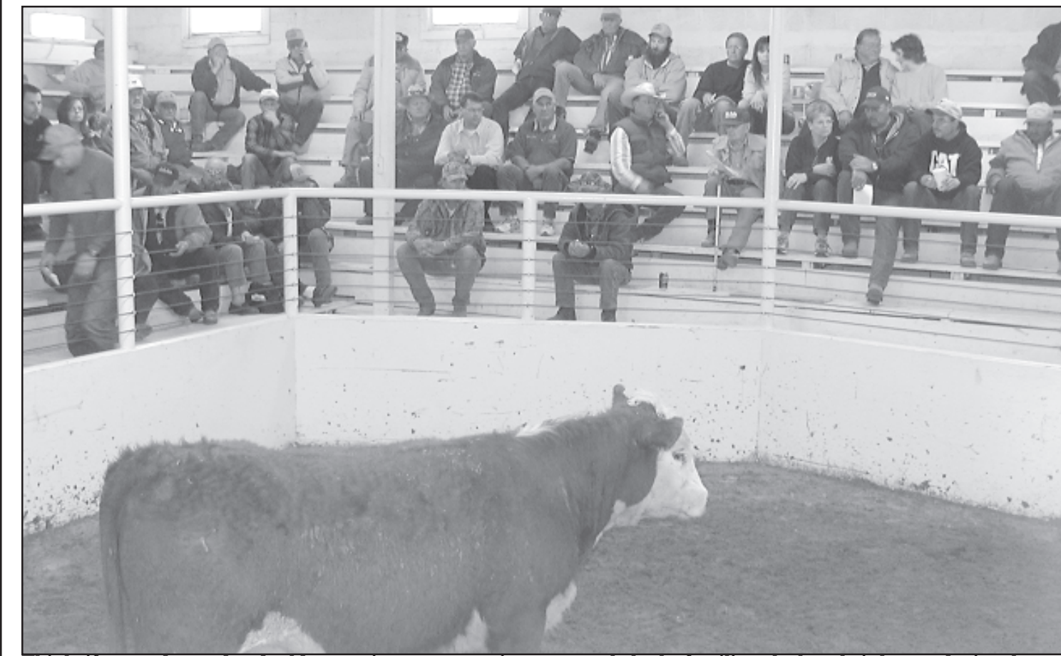
This heifer was donated and sold many times over to raise money to help the families who lost their homes during the tornado on March 28.