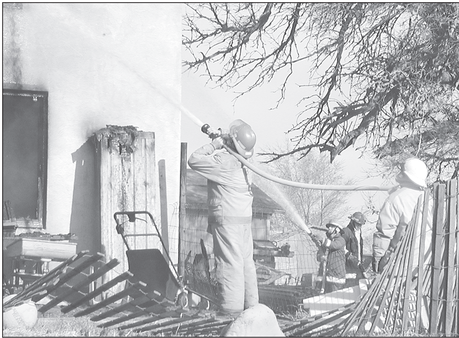
Bird City, St. Francis and Benkelman fire departments worked together to fight this house fire on Thursday.