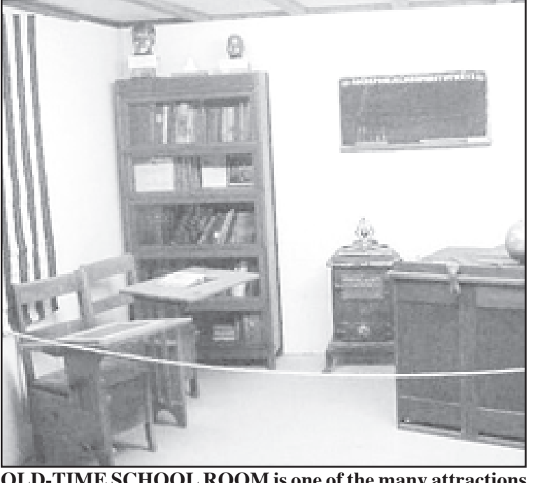
OLD-TIME SCHOOL ROOM is one of the many attractions which can be viewed at the Cheyenne County Museum. The many displays will take visitors back in time.

the cemetery tour and the Kidder compiling a second volume of the Massacre. Each year the volunteers, county history book and one on who are also generally members of country schoolhouses. the Historical Society, hold a special Flag Day ceremony.