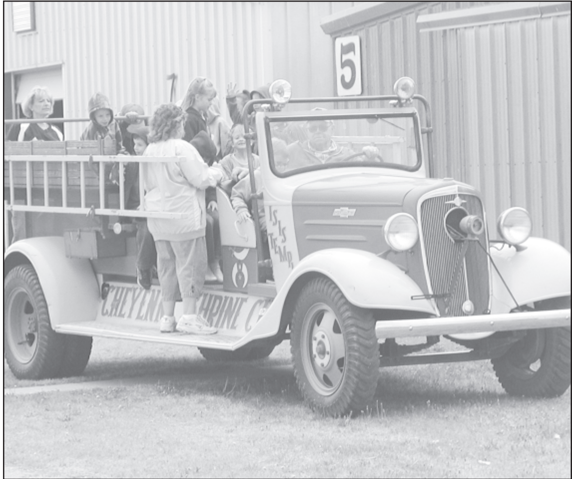
Norm Dorsch drives the fire truck to escort the first grade around the show grounds.