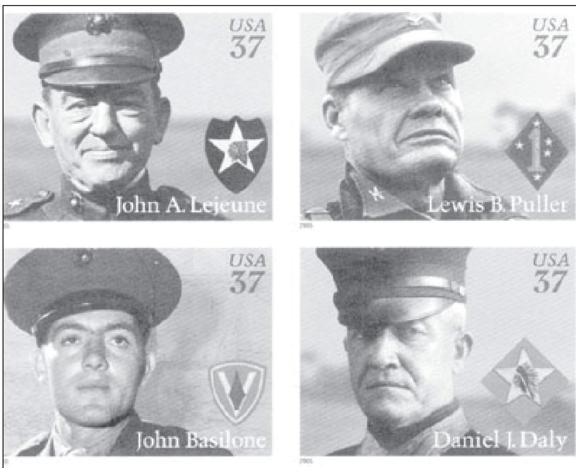
Distinguished Marines Stamp collection