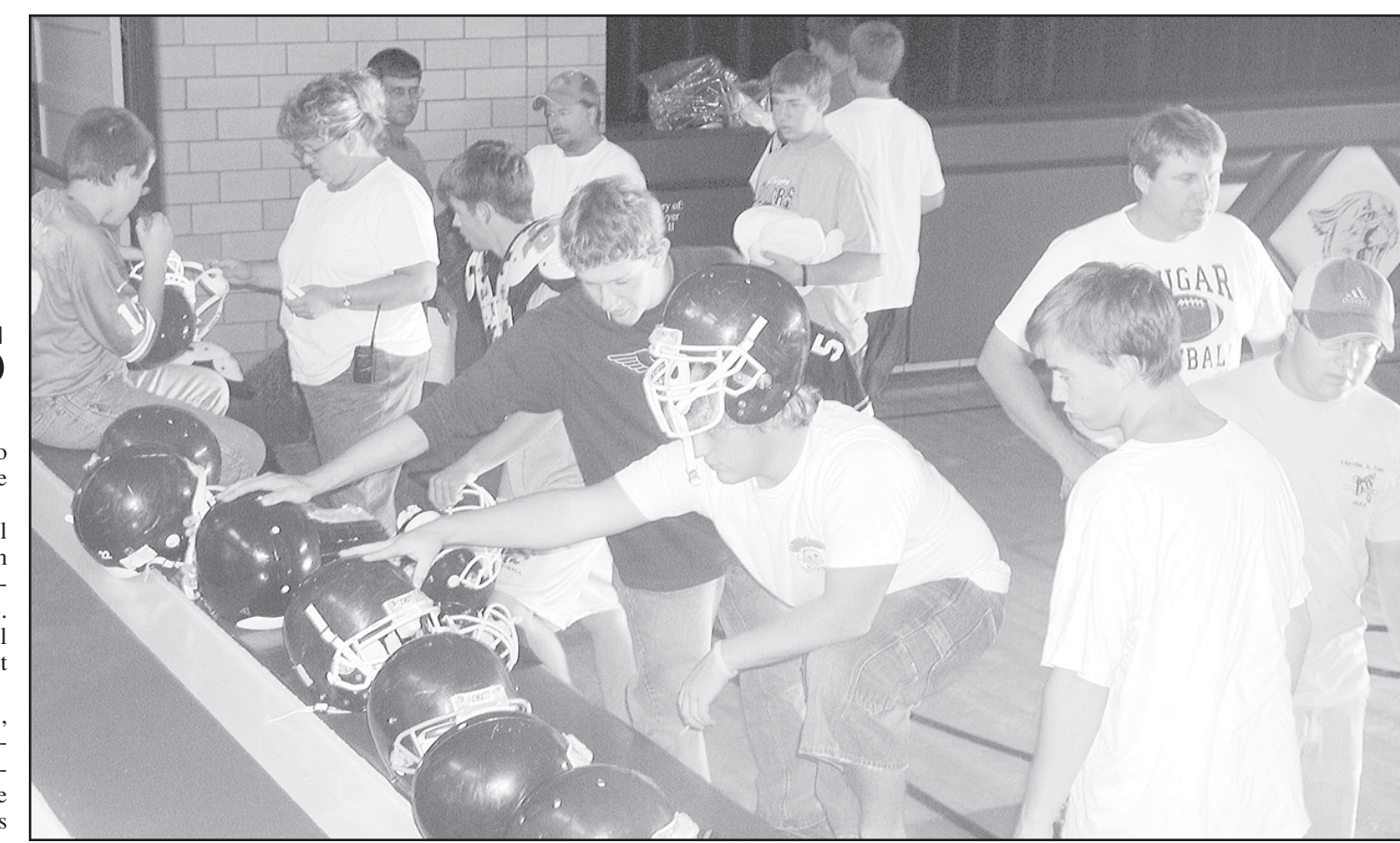
CHEYLIN COUGARS—Members of the Cheylin Cougars The team is looking forward to an outstanding season. football team pick out their gear after Sunday night's meeting.

At 7 p.m. on Thursday, Aug. 25, Football boys and volleyball families of students in grades kindergarten to eighth grade are invited to ABC parent/child game night in the cafeteria. Everyone is encouraged to bring their favorite board game and spend some quality time with the student.