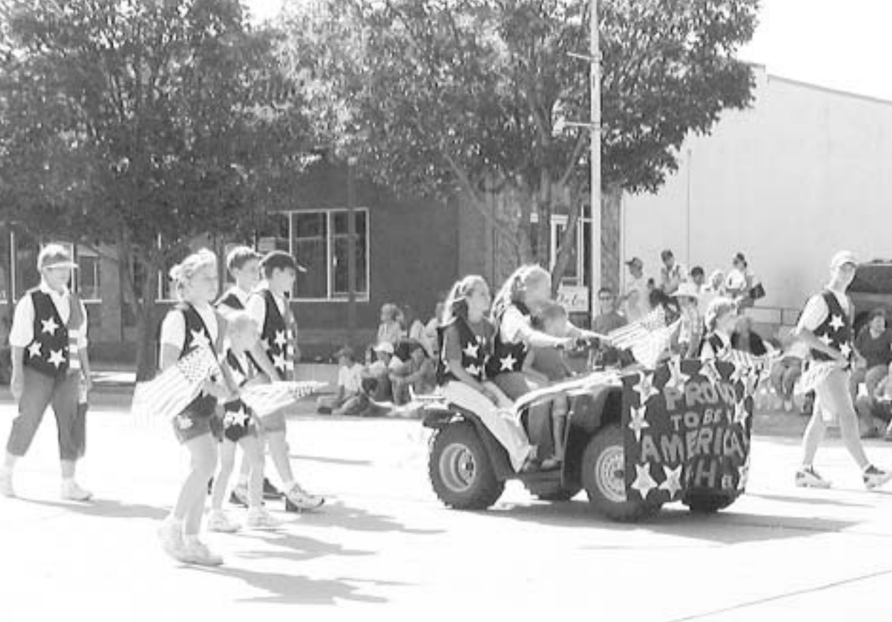
Go-Getters 4-H Club