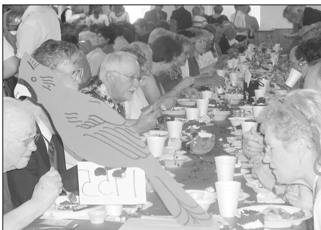
CLASS OF '55—Classmates of Bird City High School's graduating class of 1955 celebrated their 50 year reunion during Saturday night's alumni banquet.