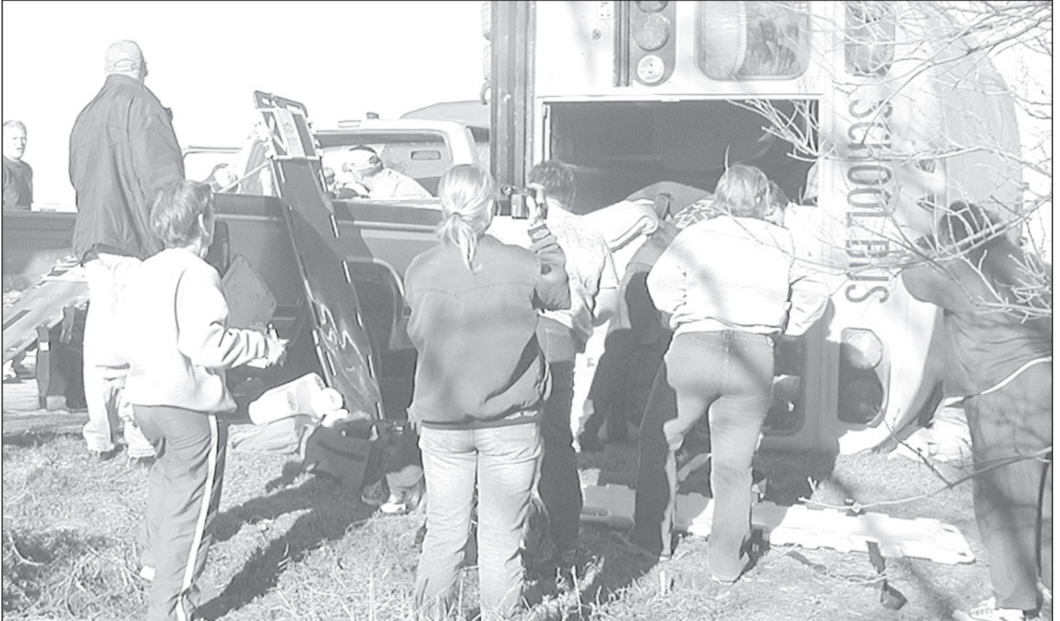
A MOCK ACTION was held Dec. 28 and emergency medical technicians scrambled to the accident. The bus was turned over and technicians worked to get inside.