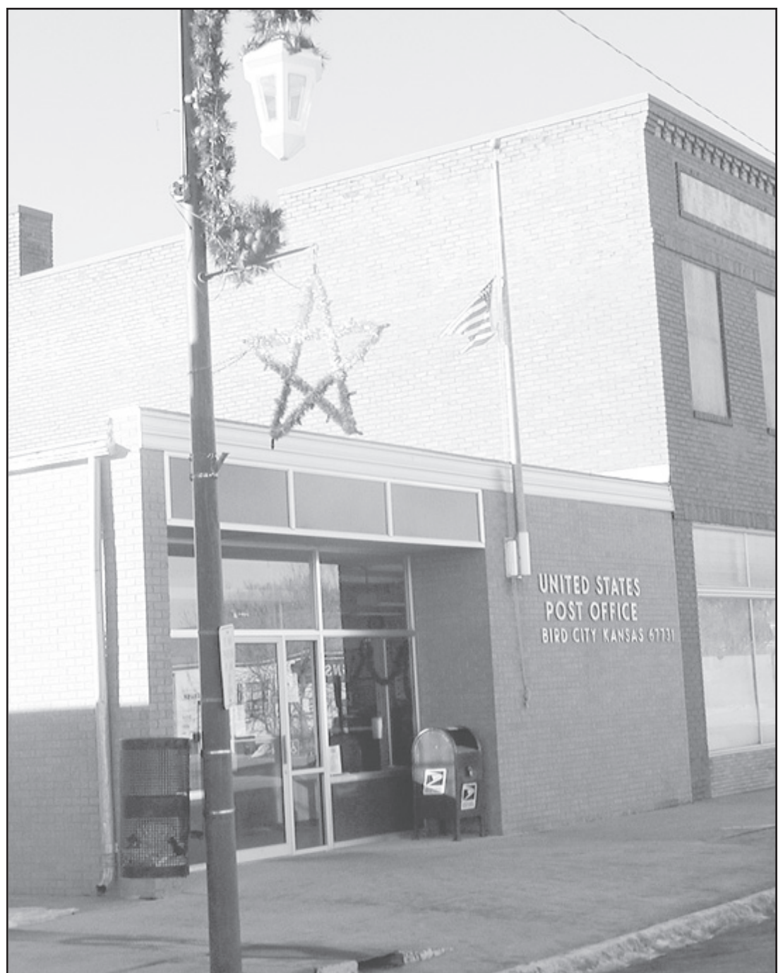
THE BIRD CITY POST OFFICE flew it's flag at half staff on Tuesday in observance of the National Pearl Harbor Remembrance Day. It's also the time of year for the streets of Bird City to be decorated for Christmas.