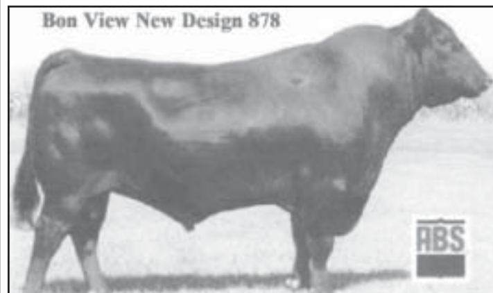
Calving ease, superior carcass, high maternal bull

Other Sires Represented at the sale include: Leachman Quest • MillBrae Plowman 1627 • N BAR Prime Time