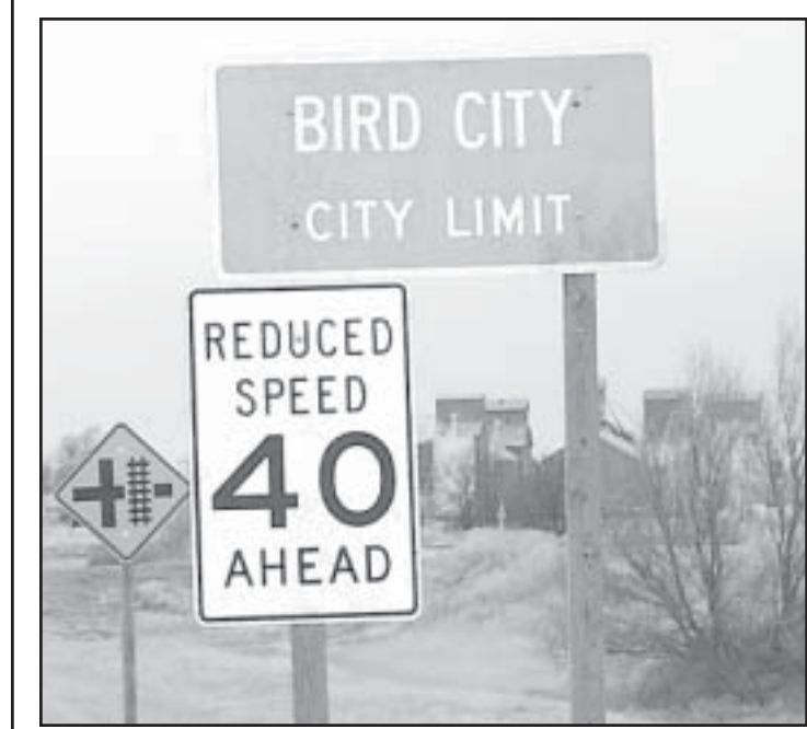
MUSICAL TRAFFIC SIGNS: Workers for the Kansas Department of Transportation returned the speed limit to the east of town on Highway 36 after they had moved the markers earlier this month. KDOT officials could not be reached for comment, watch Bird City Times for a related story soon.