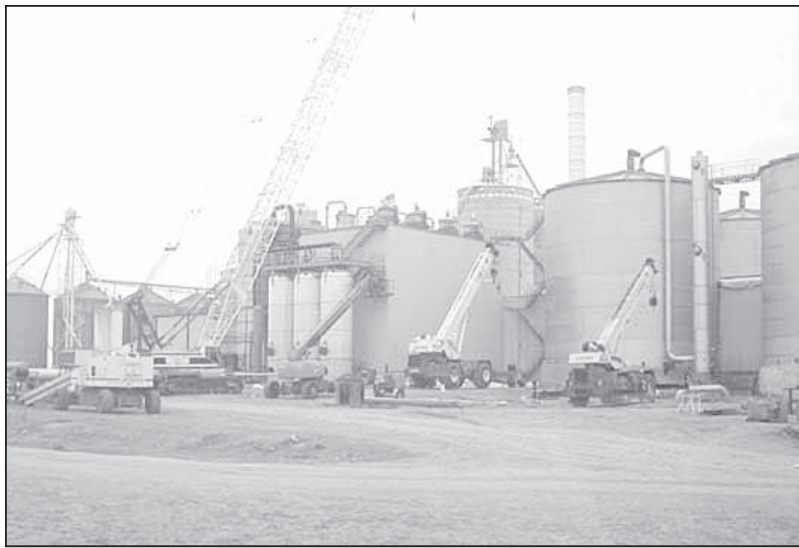
TWO CONSTRUCTION CREWS worked in concert to speed up the task of building this ethanol plant in Campus, just outside of Oakley. The plant will be up and running in early January, converting corn into fuel.

The men who will be running the facility will be sent to the Russell plant for two weeks of training in the meantime. The original plan allowed one year from ground breaking to completion of the plant. However the two crews who handled the construction of the project, I.C.M (an American firm) and Fagan Incorporated (from Germany), found them-