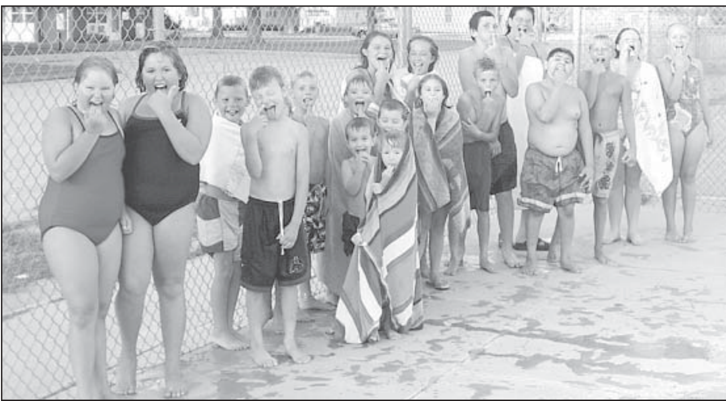
SUNDAY EVENING SWIMMERS had to leave the Bird City pool after a visitor vomited in the water. The alert staff quickly evacuated the pool and began the 12-hour process of treating the H2O.