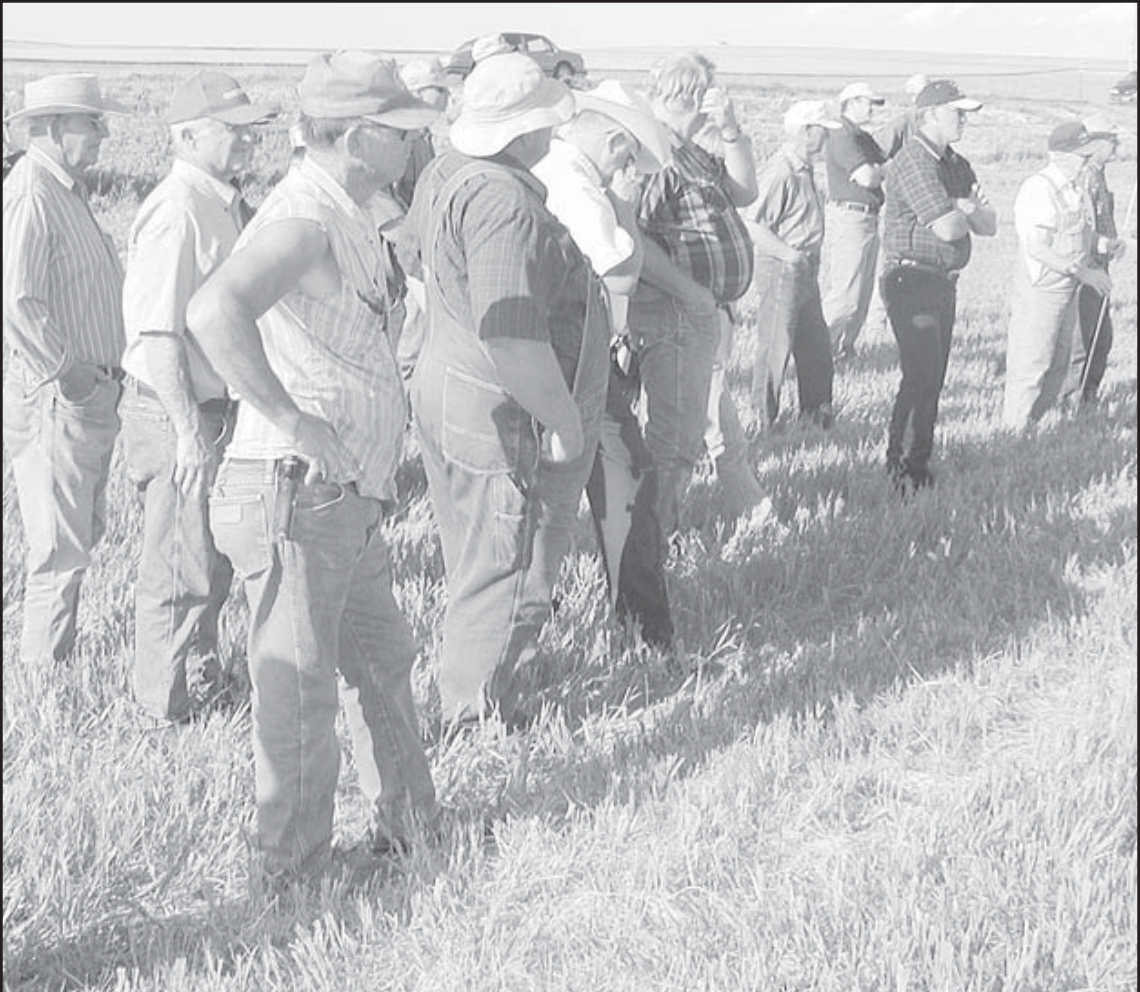
A GROUP OF FARMERS tour the test plot at Wheat Field Day held on Wednesday.