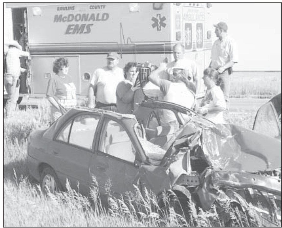
FAST WORKING EMERGENCY personnel and a good deal of luck made this accident look much worse than it could have been.