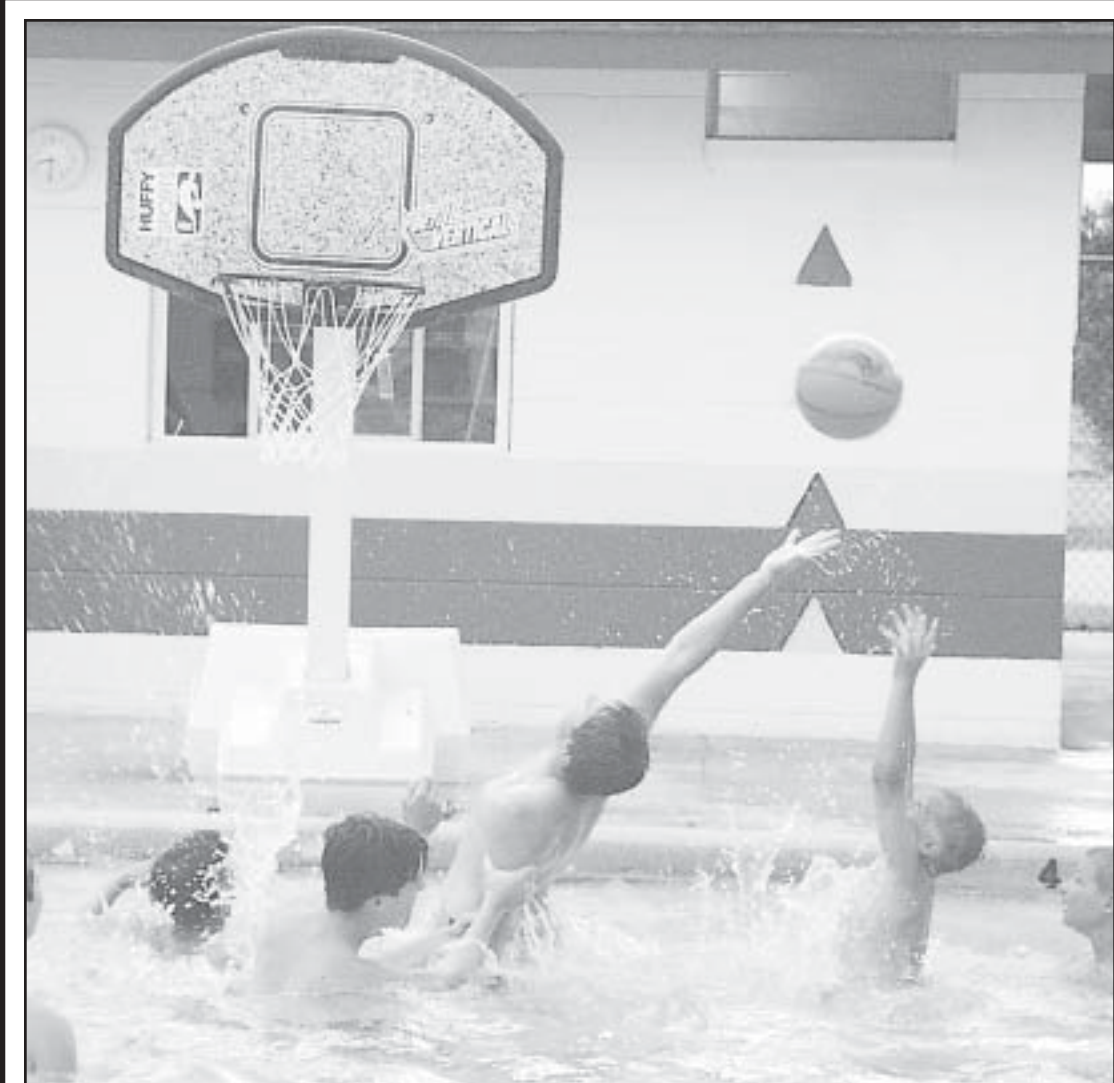
FUN IN THE SUN — Local kids enjoyed the warm weather as they cooled themselves in the Bird City swimming pool and played water basketball.