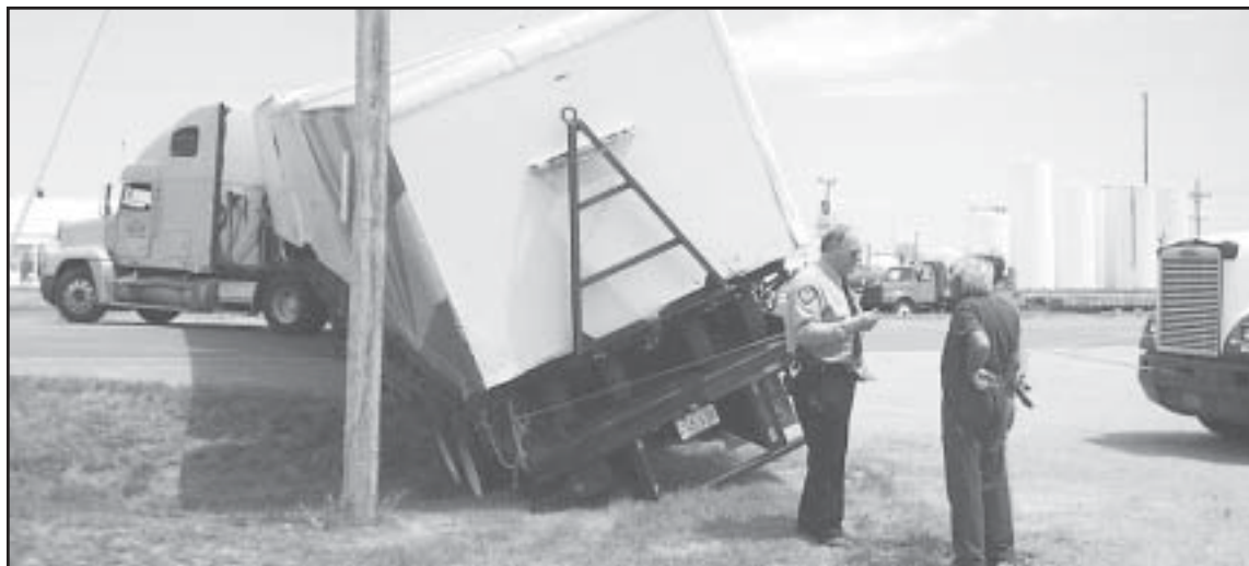
TRAVELING FROM GREELEY to Kansas City one of the Sterling and Reid Brother's Circus trucks jackknifed in front of the old gas station on U.S. 36. Luckily the truck was not carrying any animals and the truck driver was not injured.